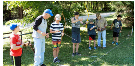
Youth Expo 2016