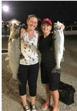
The Pepsi Team