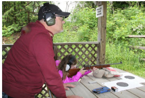
Youth Expo June 2015