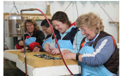
Fin Clipping Before Stocking