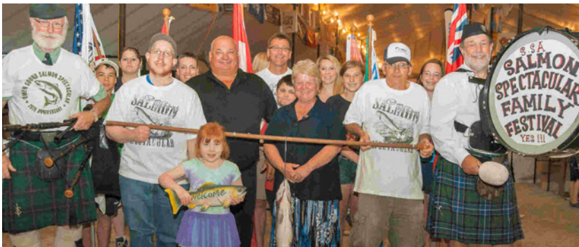
From This Year's Derby