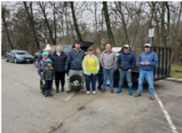
Dedicated Cleanup Volunteers