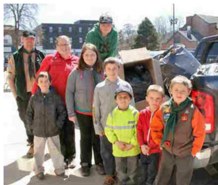
Helpers On Earth Day- Thanks!