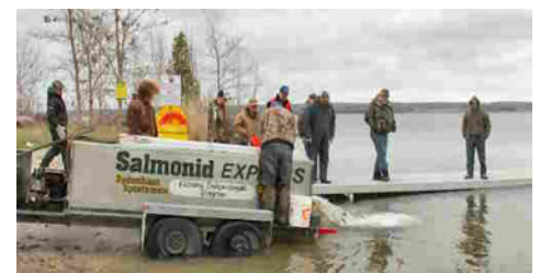
Stocking Brown and Rainbow Trout