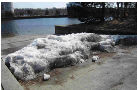
Snow blocked access to the west-side boat launch during the Easter weekend.