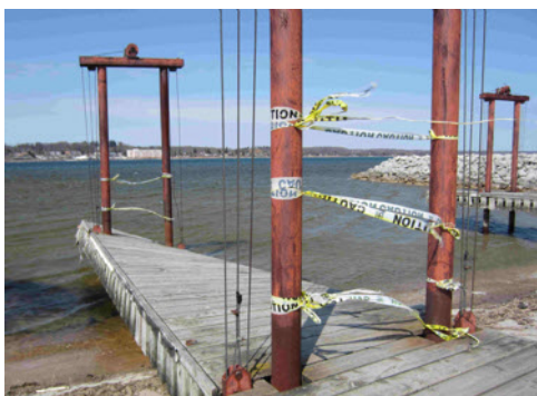
One of the docks at the east-side Bayshore Community Boat Launch, has been damaged & un-useable since last fall.