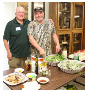
First Chowder Night