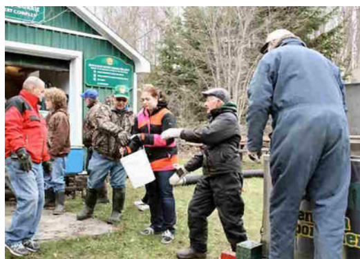
Stocking Trout At A Recent Event