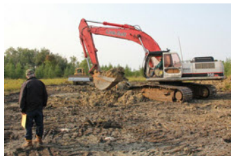
Ponds and machinery in Walker pond dig