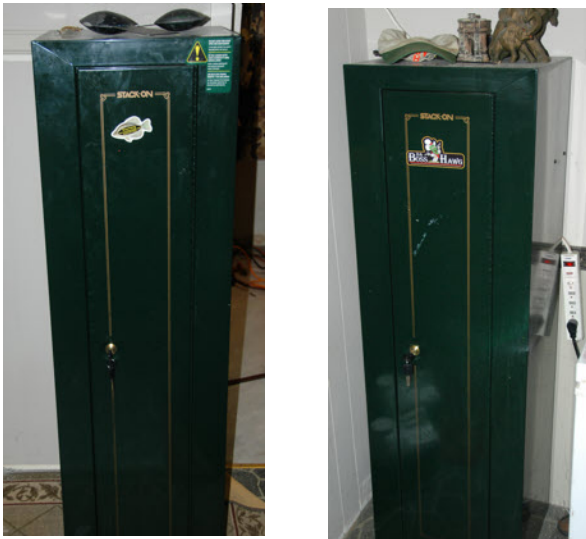
TWO STACK ON STEEL 8 GUN CABINETS WITH LOCKS $60 each