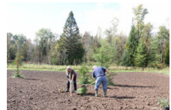
Planting flowering shrubs and milkweed pods on ground in Butterfly plot

For a coloured version of this document, go to the SSA website at http://www.sydenhamsportsmen.com/ select from SSA Newsletters - right side.