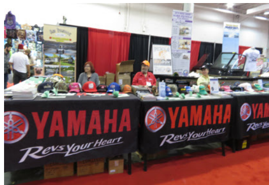
The Derby Booth at a Fishing/Boat Show